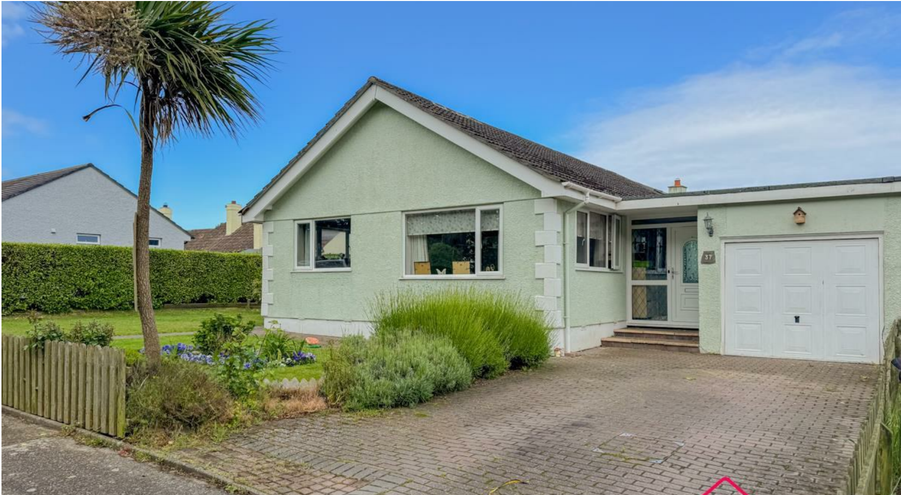
37 Cannan Avenue, Kirk Michael, Isle Of Man, IM6 1HG Asking Price £585,000